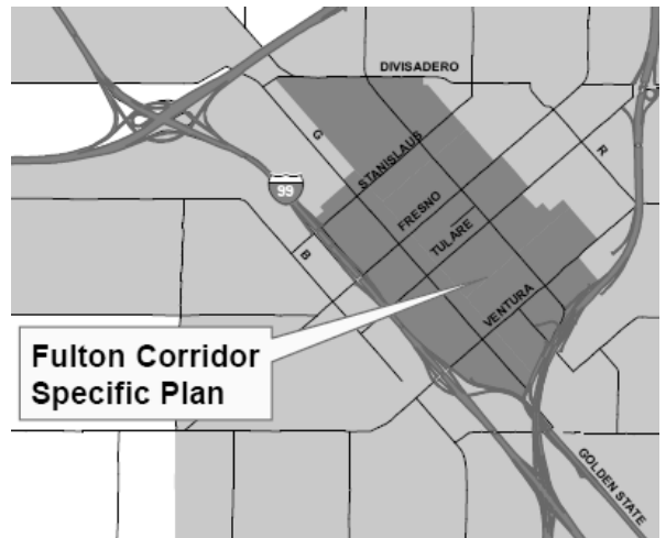
Fulton Corridor Specific Plan , roughly bordered by Divisadero on the North, California Avenue on the South, Hwy 99 on the West, and M Street (one parcel east of M St) on the East.

Mark your calendar for these important meetings. Your input is very important to the future of these districts !