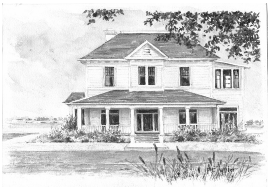
Coke Hallowell Center at the River Parkway watercolor by Pat Hunter