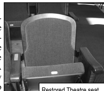
Restored Theatre seat