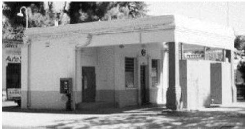
Russ Clements Station before restoration